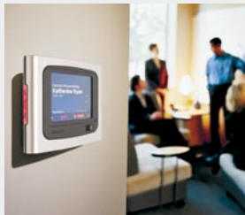
Captures Room Occupancy