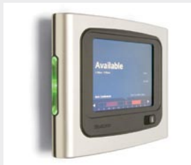
Lights Indicate Room Availability